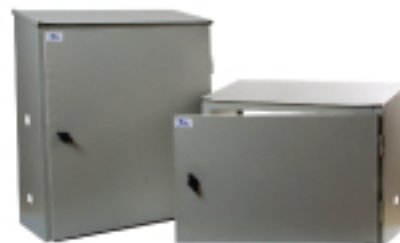
ONE METER BOX DRAWING ASSEMB