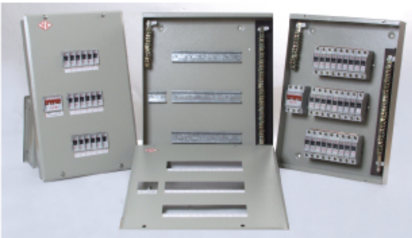
BASE AND COVER DIMENSIONS/ MM